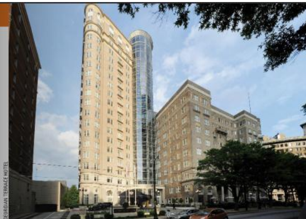
A circa-1911 luxury hotel, the Georgian Terrace Hotel hosted the gala events during the Atlanta premiere of "Gone With the Wind" in 1939.

• The Varsity , 61 North Ave., Atlanta. www.thevarsity.com . (404) 881-1706. "What'll Ya Have?" Lots of fast food to choose from at the World's Largest Drive-in Restaurant.