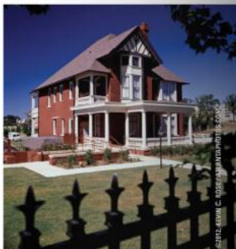
The Margaret Mitchell House is located in Atlanta’s Midtown on Peachtree Street.

Like Dorothy and her yellow-brick-road odyssey, trailblazers should begin their explorations at the trailhead: the Marietta Gone With the Wind Museum—Scarlett on the Square, a repository of such treasures as Mitchell’s personal volumes of the novel, rare press and publicity books, cast member contracts, actress Ora Munson’s (Belle Watling) working script and more. The piece de résis-