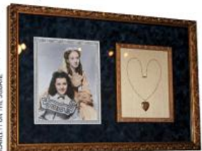
This heart-shaped pendant, belonging to Ann Rutherford, left, was what the actress wore in "Gone With the Wind" and many of her other movies as a good luck charm.

Other Atlanta sites: The Atlanta History Center maintains one of the