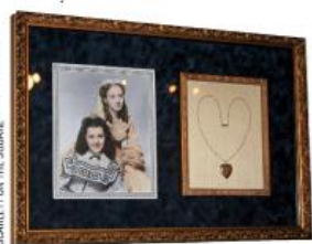
This heart-shaped pendant, belonging to Ann Rutherford, left, was what the actress wore in "Gone With the Wind" and many of her other movies as a good luck charm.