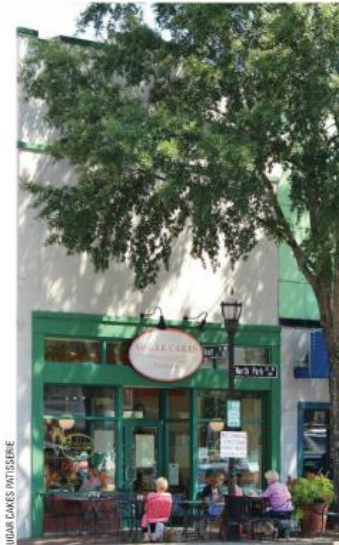
Sugar Cakes Patisserie, a French-style bakery and restaurant, is a charmer on the Marietta Square.

Establishments listed in this section are provided as a courtesy and not intended as an endorsement or recommendation by GEORGIA Magazine . To read more about the Gone With the Wind Trail in this month's issue, see page 18.