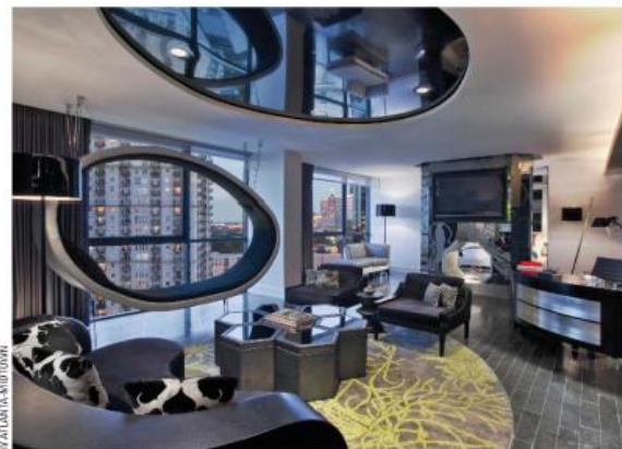
The W Atlanta-Midtown is a lush hideaway in the midst of downtown's hustle and bustle.