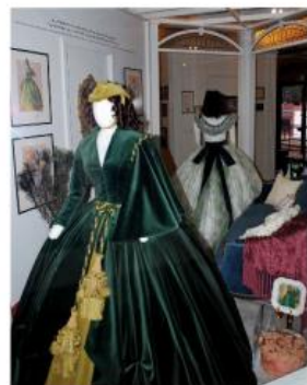
Reproduction dresses are authentic in detail, down to the gilded chicken feet adorning the hat of the green drapery dress.

At the Atlanta-Fulton Public Library System’s Central Library, see the Remington typewriter on which Mitchell composed “ Gone With the Wind .” Besides the typewriter, the library holds a vast collection of Mitchell’s photographs, books and personal items—some 1,500 pieces—including the author’s Atlanta Public Library card and hundreds of person-