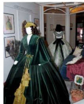
Reproduction dresses are authentic in detail, down to the gilded chicken feet adorning the hat of the green drapery dress.

At the Atlanta-Fulton Public Library System’s Central Library, see the Remington typewriter on which Mitchell composed “ Gone With the Wind .” Besides the typewriter, the library holds a vast collection of Mitchell’s photographs, books and personal items—some 1,500 pieces—including the author’s Atlanta Public Library card and hundreds of person-