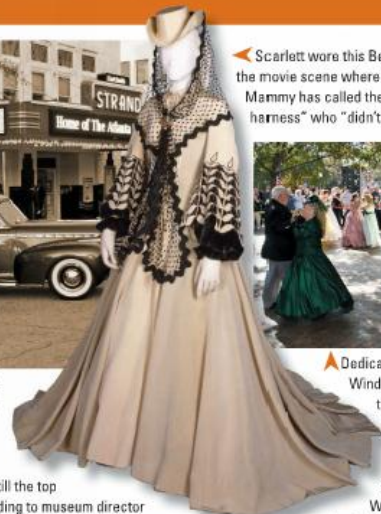
Scarlett wore this Bengaline gown in the movie scene where she tells Rhett that Mammy has called them “mules in horse harness” who “didn’t fool anybody.”