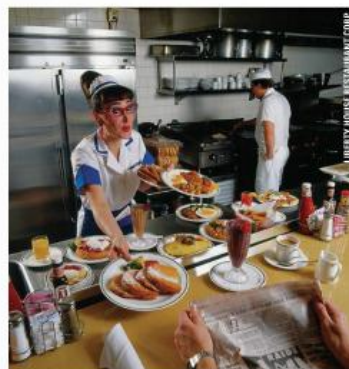
Dining at the OK Café is pure fun whether you dine in or carry out.

• Road To Tara Museum , 104 North Main St., Jonesboro. www.visitscarlett.com . (770) 478-4800.