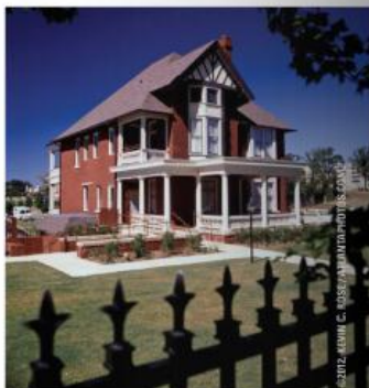
The Margaret Mitchell House is located in Atlanta’s Midtown on Peachtree Street.