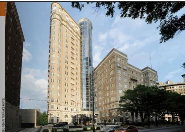
GEORGIAN TERRACE HOTEL

A circa-1911 luxury hotel, the Georgian Terrace Hotel hosted the gala events during the Atlanta premiere of "Gone With the Wind" in 1939.