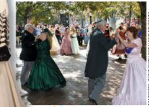
Dedicated “ Gone With the Wind ” fans show the depth of their devotion to the book and the film as they dance the Virginia reel on the Marietta Square during the Marietta Gone With the Wind —Scarlett on the Square’s November 2009 re-premiere of “ Gone With the Wind .”