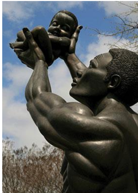
The Behold monument at Atlanta's Martin Luther King Jr. National Historic Site reveals an infant silhouetted against a broad expanse of Georgia sky.

King received the Nobel Peace Prize in 1964 for his tireless struggle for freedom and equality. Four years later, he was felled by an assassin's bullet in Memphis, where he had gone to support striking sanitation workers. His funeral was conducted April 9, 1968, at Atlanta's Ebenezer Baptist Church, the same church in which he was baptized and, at 19, ordained as a minister. Recently restored and