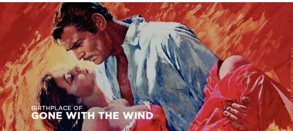
BIRTHPLACE OF GONE WITH THE WIND