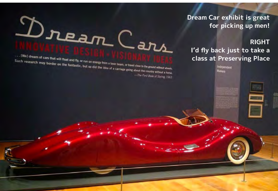
Dream Car exhibit is great for picking up men!

Pssst: If you donate $250 you can have your name or a message permanently displayed on a metal tile in the lobby. Check out this video for a preview of this fabulous new museum.