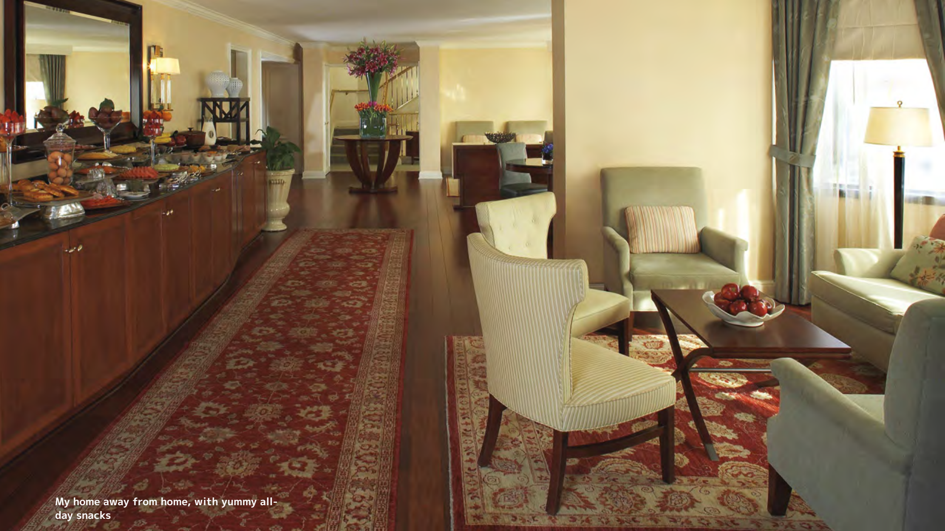
My home away from home, with yummy all-day snacks