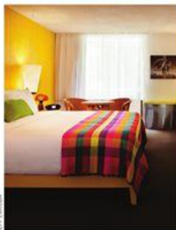
The Saguro's psychedelic take on Southwestern style extends to the guest rooms

Book it: Rooms from $189; 480-308-1200; jdhotels.com/hotels/saguro.