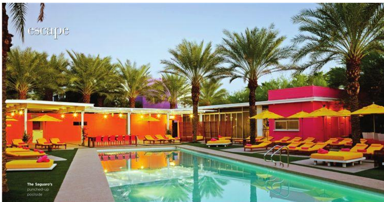
The Saguro's punched-up poolside