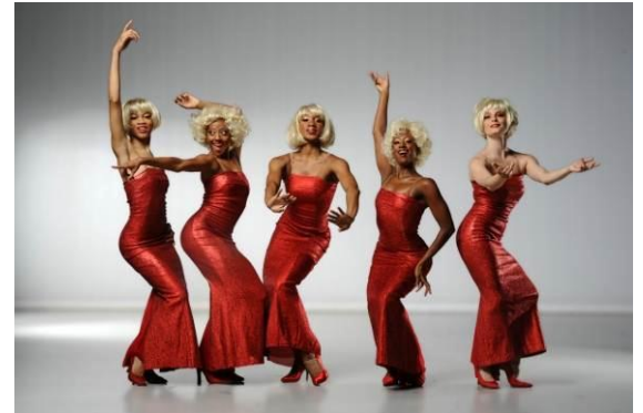
Alvin Ailey's Quintet.