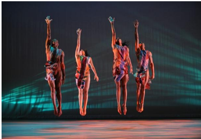
Ailey II in Judith Jamison's Divining.