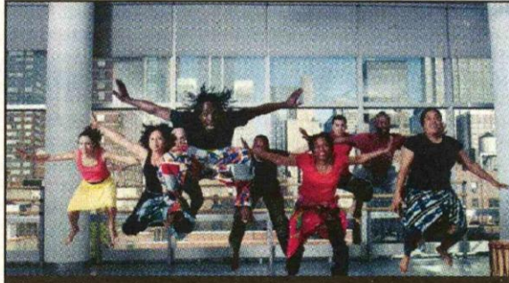
West African class at the Ailey Extension.

Tickets start at $25 and are available at the New York City Center box office, through CityTix at 212-581-1212 or online at www.alvinailey.org or www.nycitycenter.org . Each "Ticket to Dance" is good for one year from the performance date for first-time students, and when purchasing a 10-class card for classes at the Ailey Extension in New York City for returning students.