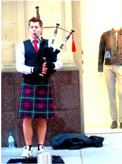
Man with bagpipes.