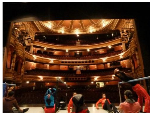
Walking toward the Glasgow Kings Theatre for Rehearsal and view from the stage inside.