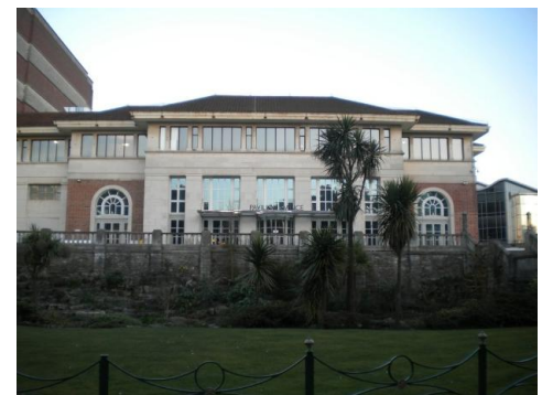
The beautiful Bournemouth Pavilion Theatre.