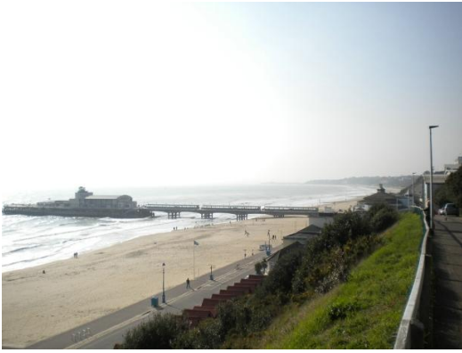
Overlooking the sea one morning in Bournemouth.

Another beautiful city overlooking the sea! We stayed at the Royal Bath Hotel, which is grand enough to make you feel like royalty. A lot of our time off was spent in the main bar/reception area since that's where the best internet connection was. It's funny how much we rely on technology to stay connected with family and friends back in the states. It makes me wonder how people kept in touch while touring back in the pre-Skype days.