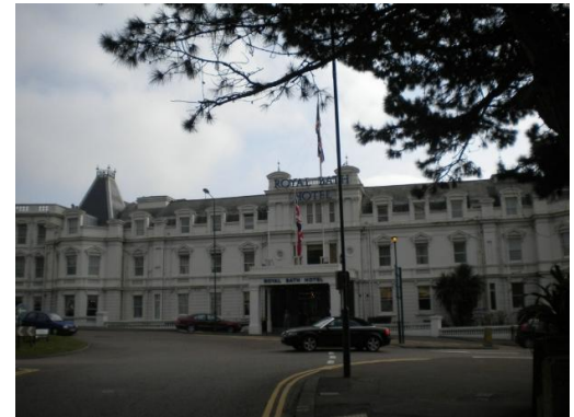
The Royal Bath Hotel.

beforehand. He always reminds us to play with the music and perform the combinations during class. I'm also discovering how helpful it is to re-warm-up just before a performance and during intermissions (after touching up the hair and makeup of course).