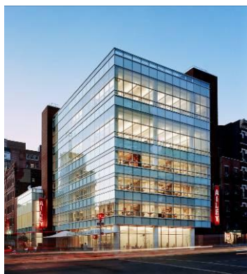
The Joan Weill Center for Dance (55 th Street & 9 th Avenue, NYC).

2004 – The United States Postal Service issues a first class postage stamp honoring Alvin Ailey as part of the American Choreographers stamp series, which commemorates four visionary 20 th century choreographers who left a profound mark on the language of dance.