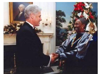
President Bill Clinton and Judith Jamison.

Ailey in the Park attracts 30,000 spectators, who congregate in New York City’s Central Park to see the live performance.