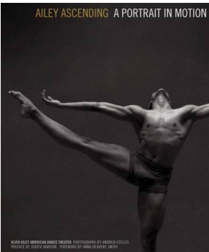
Ailey Ascending: A Portrait in Motion (Chronicle Books, 2009).

In 2001, Ms. Jamison and the Ailey organization were recipients of the National Medal of Arts. AAADT was the first dance company to be so honored, and this was the first occasion when an arts organization and its artistic director were recognized independently with this prestigious award in the same year. In 2009, The New York Times declared that she is "surely the most stellar and admired artistic director of any repertory dance company in America."