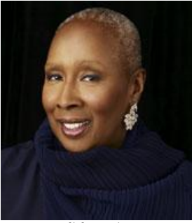
Judith Jamison

Alvin Ailey American Dance Theater's 2010-2011 New York City Center Season and 20-City US Tour will mark the renowned Judith Jamison's final year as Artistic Director. Over the past two decades, her visionary leadership has carried the Ailey organization to new and profound heights.