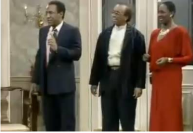
The Cosby Show. Judith Jamison guest appearance

1983 – AAADT celebrates its 25 th anniversary with an anniversary benefit The New York Times calls “the biggest celebration of all” and further proclaims that “The Alvin Ailey American Dance Theater is not just a company, it is a school of thought.”