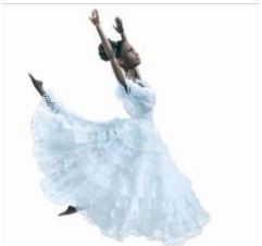
The Alvin Ailey Barbie Doll @Collector Pink

Ms. Jamison recently led the Company on a 50-city global tour celebrating AAADT's 50 th anniversary with a year-long series of special performances, collaborations (including Wynton Marsalis and Jazz at Lincoln Center and Sweet Honey In The Rock), events, projects and commemorative merchandise such as Ailey Hallmark Cards, Ailey Movado Timepiece, Ailey Ascending photographic art book and an Ailey Barbie Doll by Mattel (designed by Ms. Jamison, it was the first Barbie inspired by a dance company).