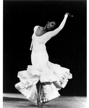
Judith Jamison in Cry.

1971 – Alvin Ailey choreographs Cry for Judith Jamison as a birthday present to his mother. Cry becomes an instant hit, bringing even more popularity to Alvin Ailey as a brilliant choreographer and Judith Jamison as an extraordinary dancer.