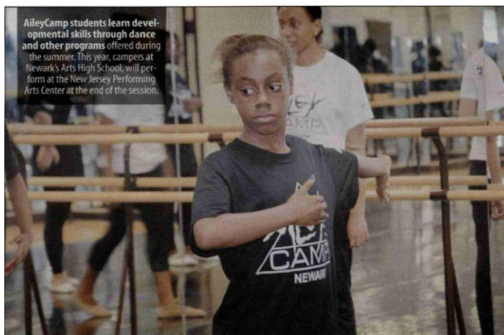
AileyCamp students learn developmental skills through dance and other programs offered during the summer. This year, campers at Newark's Arts High School will perform at the New Jersey Performing Arts Center at the end of the session.