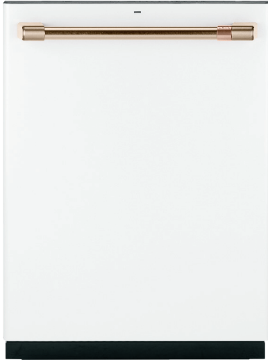
CDT866P4MW2 Matte White with Brushed Bronze handles